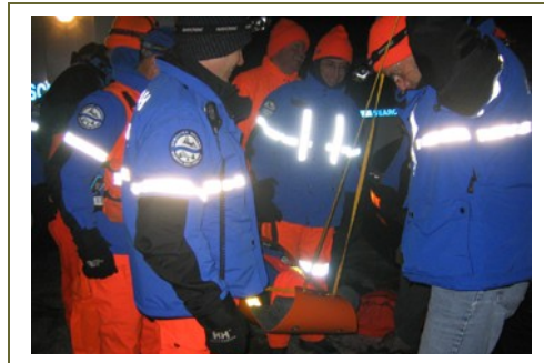
Dedicated members train all year long.

Training Questions??? Email Bart Pouteau