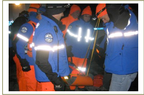
Dedicated members train all year long.